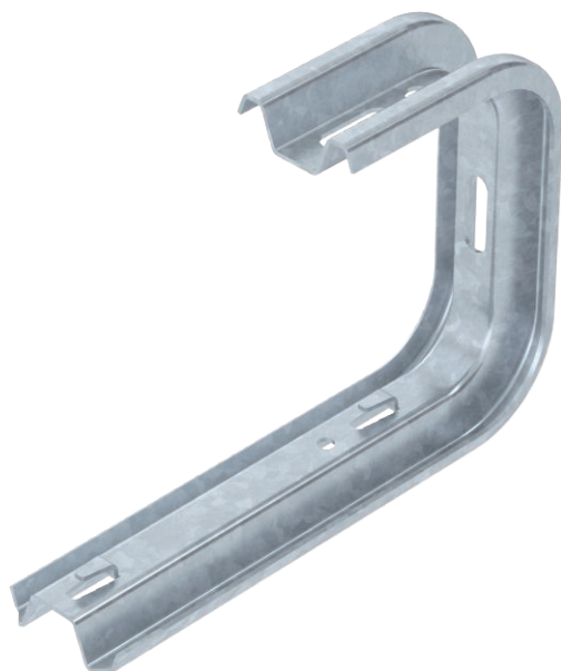
TP wall and ceiling bracket with clamping lugs for screwless mesh cable tray fastening.