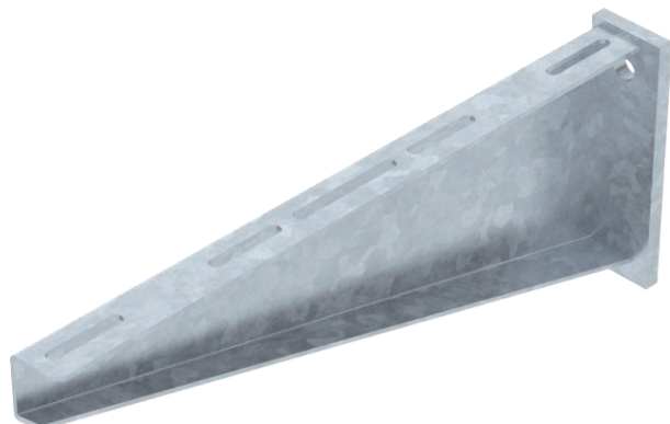
Heavy-duty wall bracket with welded head plate.