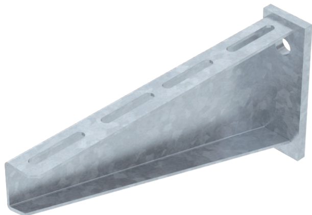
Heavy-duty wall bracket with welded head plate.