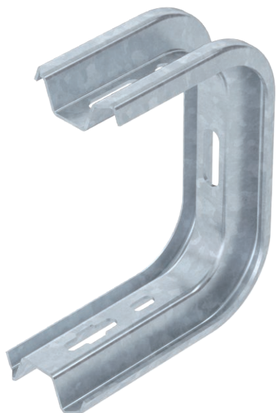
TP wall and ceiling bracket for universal use.