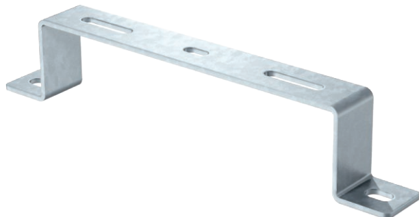
Stand-off bracket for cable trays and mesh cable trays.