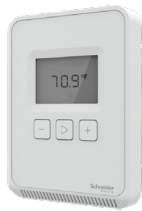
LCD with Buttons