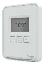
LCD with Buttons