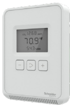
LCD with Buttons