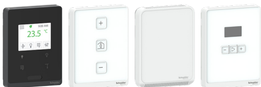
Note: A subset of models shown.

SXWS sensors are a family of living space sensors for use with MP and RP IP controllers that use the EcoStruxure Building Operation user interface. These sensors use an RJ-45 sensor bus that provides communication and power from the IP controller. For quick installation, up to four SXWS sensors may be connected to each IP controller through the RJ-45 sensor bus using Cat 5/6 cable (22 to 26 AWG). A Bluetooth® adapter is available for commissioning and service. It is temporarily connected to installed communicating sensors and allows for quick setup and configuration. The Bluetooth adapter communicates to upload devices (smart phone, laptop, table, etc.) with the Living Space Sensor EcoStruxure Building Operation app installed via USB or Bluetooth communications.