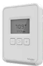
LCD with Buttons