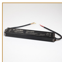
Zasilacz LLG 150W wodoodporny NExtec power supply LLG 150W