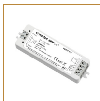
Sterownik do taśm jednokolorowych Single colour LED strips controller