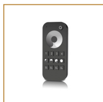
Pilot do taśm jednokolorowych Remote controller for single colour LED strips